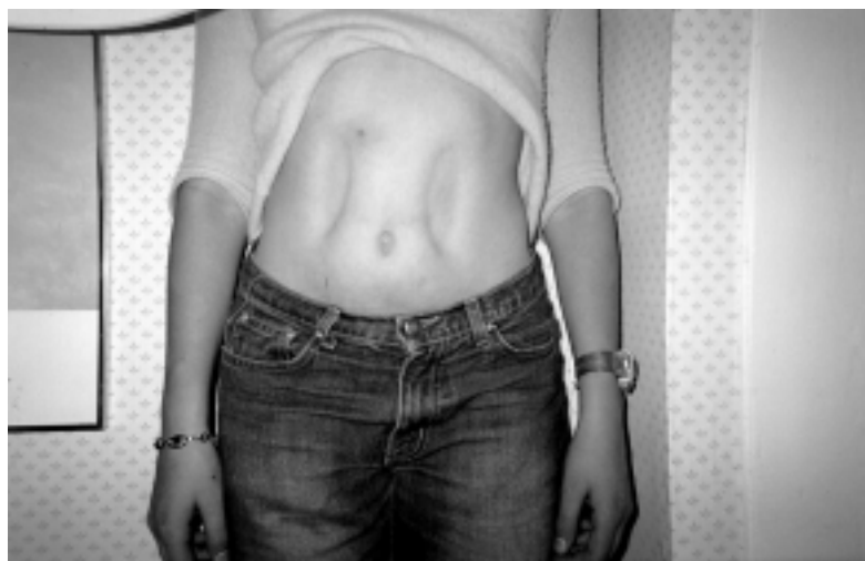
Figure 1—Two large areas of lipoatrophy in the 10-year-old patient.