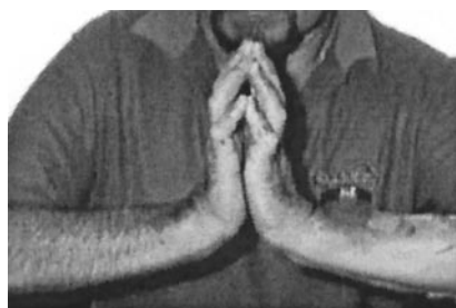
Figure 2 —The “prayer sign” caused by the failure of opposition of the palmer surfaces of the hands due to joint limitation, is a useful clinical sign for identification of patients with limited joint mobility. (Reproduced by permission of BMJ publishing. From Smith LL, Burnet SP, McNeil JD. Br J Sports Med 37:30–35, 2003. Copyright 2003 BMJ publishing.)

cases with joint limitation had evidence of retinopathy compared with those with normal joint mobility (49 vs. 18%, P < 0.001 ). Twenty-nine percent of cases with LJM had albumin-to-creatinine ratio >3.0 mg/mmol compared with 10% of cases surveyed with normal hand mobility ( P < 0.01 ). The albumin-to-creatinine ratio for affected patients was 0.8 mg/mmol (0.55–3.63) [median (interquartile range)] compared with 0.62 mg/mmol (0.43–1.37) for those with normal hand mobility ( P = 0.008 ).